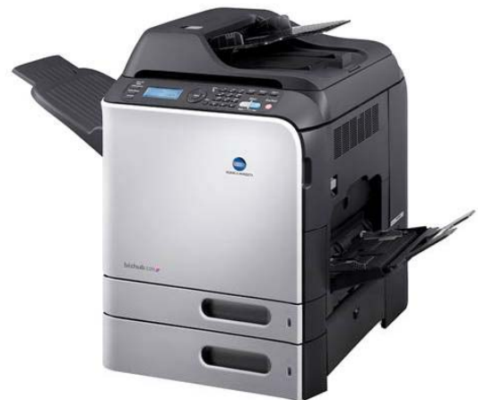
Configured with optional paper tray