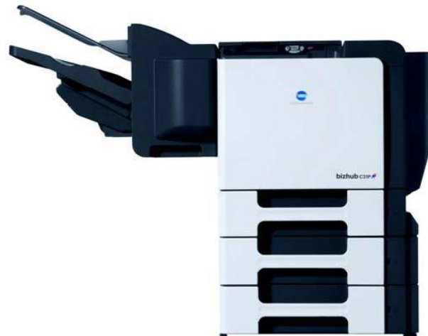
Configured with: Offset Stacker 2x 550 Sheet Paper Trays