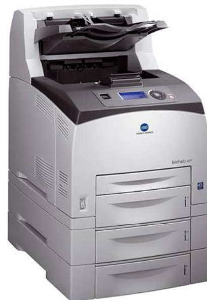
Configured with: Offset Stacker 2x 550 Sheet Paper Trays