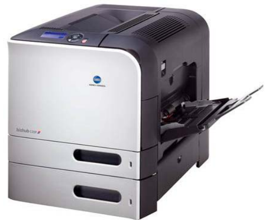
Configured with optional paper tray